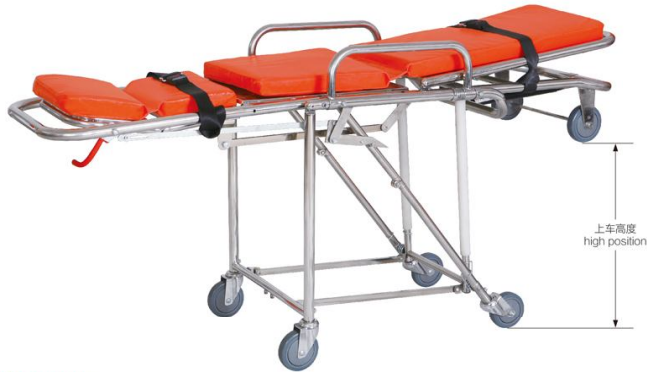
上车高度 high position