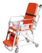
折叠后 可进电梯 It could be into the elevator after folding