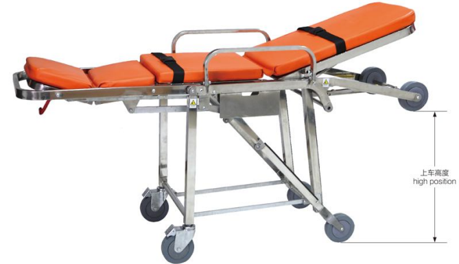
上车高度 high position