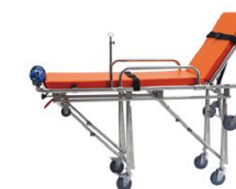
折叠后可进电梯 It could be into the elevator after folding