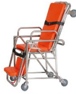
折叠后可进电梯 It could be into the elevator after folding