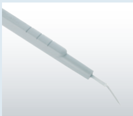
FOOT CONTROL PENCIL

Employed use of sheaths promotes pencil longevity, speeds changeover from patient to patient, and prevents pencil exposure to contaminants.