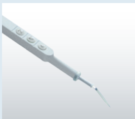
HAND CONTROL PENCIL